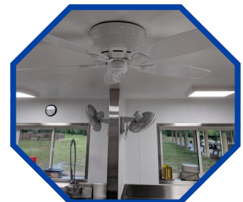
As a final step to the kitchen renovations, four ceiling fans were added, along with two wall-mounted fans, which you can see in the background.