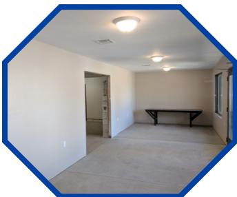
The new welcome area inside the covered entrance is nearly complete.

Over the past few months, Jim Yoder and other volunteers have been busy creating a new storage space and nearly finishing the new welcome area. They have spent time framing, drywalling, painting, and installing fixtures. Six fans (four ceiling, two wall mount) were installed to improve air circulation in the kitchen. Big thank-yous to all who have helped with this part of the project! The next step will be replacing the dining hall windows and doors, to take place this fall.